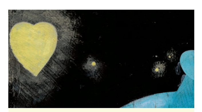
There is a part of me that is looking forward to death and thinks it is going to be a great adventure.

If we think about this from a survival point of view, it is probably going to be difficult for any of these personas to survive. We won't have a body with which to make our internal sensations have a certain familiar kind of pattern or flavor. We won't