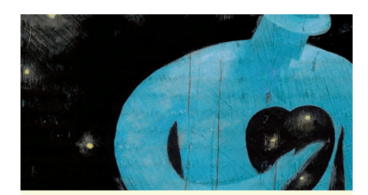
I think we are living this embodied life for a purpose, a purpose that has something to do with learning.

Altered states of consciousness remind us that there are frontiers of the human mind that we can't begin to grasp in our ordinary state of consciousness. So when we think about our question, "Who am I?"—Who or what might survive physical death?—we have to take into account that while we do almost all our living in a one-note style, in this ordinary state